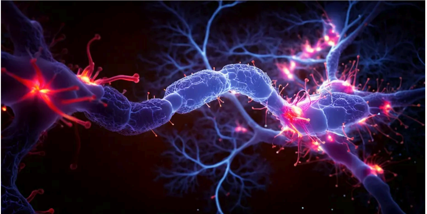
UCLA scientists created an off-the-shelf CAR-NKT cell therapy that killed pancreatic tumors in multiple pre-clinical models.